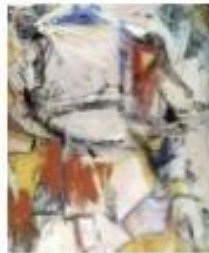
b. Interchange by Willem de Kooning