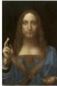
a. Salvator Mundi by Leonardo da Vinci