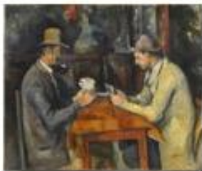
c. The Card Players by Paul Cézanne