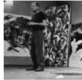
e. Number 17A by Jackson Pollock