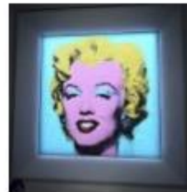
g. Shot Sage Blue Marilyn by Andy Warhol