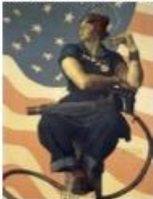
5. Rosie the Riveter: