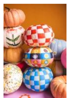
Have fun this Fall with Pumpkins!!!!