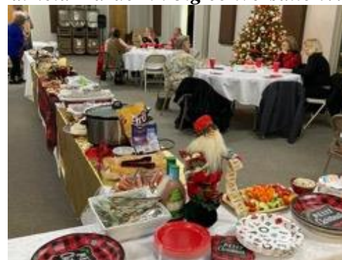
The food was great!