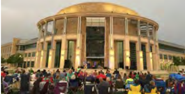
The 2024 Sounds of Spring Live Music Concerts return for 5 Friday Nights,

April 19 through May 17, 2024. You, your family and friends are invited to join us for these free and family-friendly outdoor shows at NRH City Hall Plaza, 4301 City Point Drive. Bring your blankets and lawn chairs for an evening of great music under the stars!