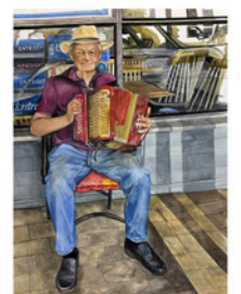
SIDEWALK CONCERT Watercolor 20 x 24 $420