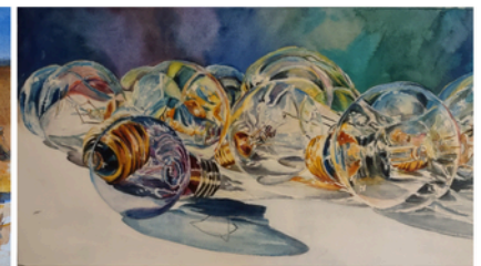
BRIGHTER IDEAS Watercolor 24 x 16