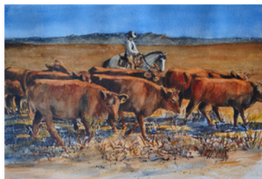
MOVING DAY Watercolor 20 x 24