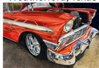
JUST SHOWING OFF WATERCOLOR 20 x 24 $420