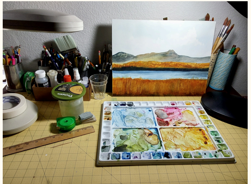
Cher Crosby's newest watercolor.