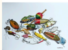
ANTIQUe LURES Watercolor 20 x 24 $420