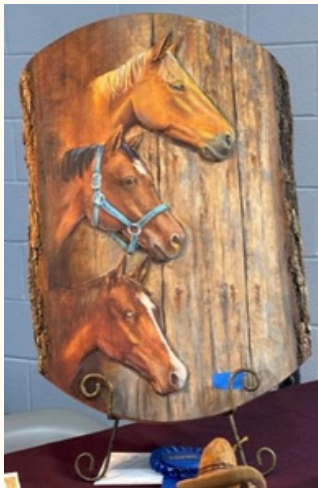
Becky Anthony was First Runner Up to Best in show for Rio Grand Valley Woodcarvers Show.