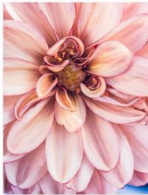
Carmen Davailus Dahlia Daze, Photography