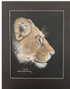
Marla Grey Sheft The Lioness, Watercolor